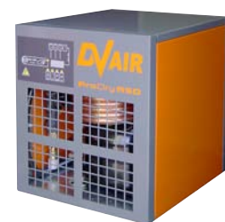
ASD 10 Dryer

Water and oily residues can build-up in your system and cause problems with controls and instruments. Our HTD and ASD series dryers remove water and water vapour, when combined with our special purpose air line filters, they are ideally suited for use in conjunction with DeVair Simplex and Duplex compressors.