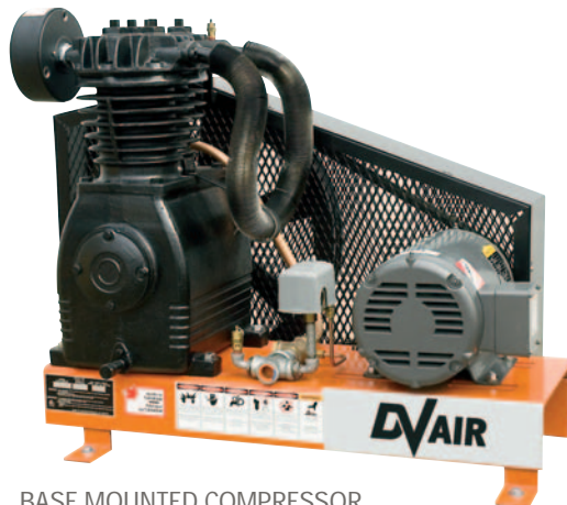
BASE MOUNTED COMPRESSOR