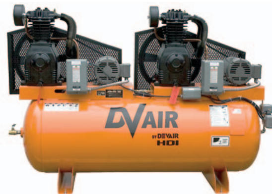
TANK MOUNTED DUPLEX COMPRESSOR