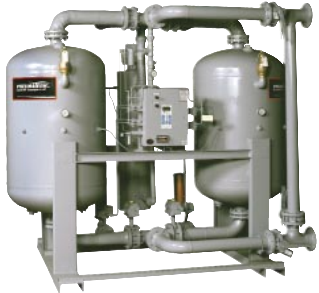
PES-2100 with bypass piping and Cycle Sight™